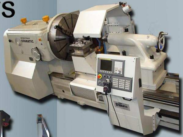
6m DHG Centre Lathe