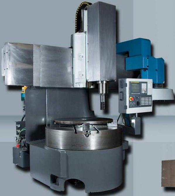
48" W&B with 20 Tool BT-50 Carousel