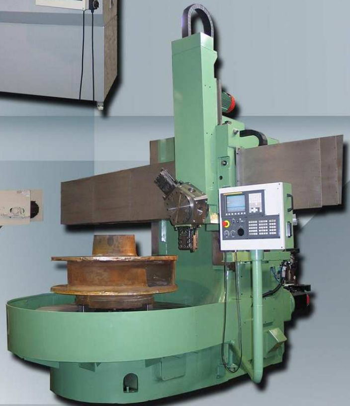
72" W&B with Elevating rail and Servo Driven Turret